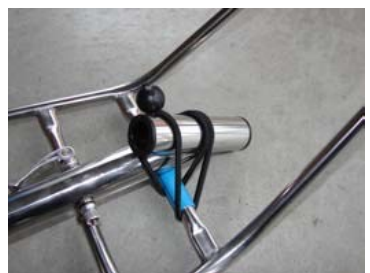
4.Slide the skin under the chassis. Locate the hole in the front of the skin with the fork tube but do not pull the skin over the Footbar yet.